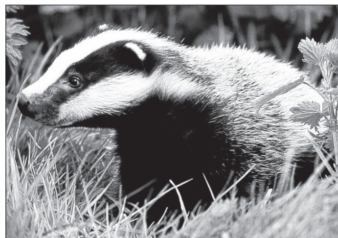
DEATH THREAT: Farmers say a cull is the only way to curb TB in cattle but animal welfare groups claim vaccination and other measures are better.

However, the National Farmers' Union (NFU) argue it is not about eradicating badgers, but eradicating the disease. "Sometimes we have to do what is unpopular because we know it is right. Not taking action is