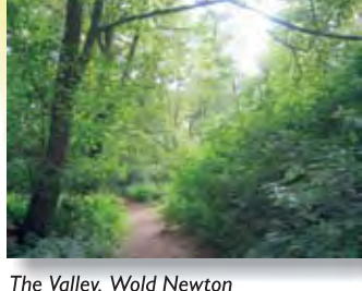
The Valley, Wold Newton