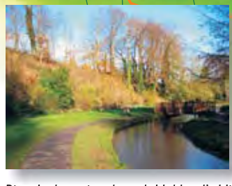
River Lud running through Hubbard's Hills

1 The walk begins ¼ mile south of the hospital at the roundabout in Scarcho village. Walk down Waltham Road passing the car park. Take the 1 st right into Springfield Road. Follow the road where it becomes Lavenham Road, then take the 1 st right, Followfield Road and again 1 st right, Oxcombe Close. Follow the waymarked brideway.