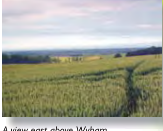
A view east above Wyham