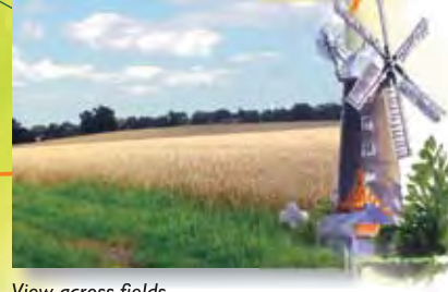
View across fields toward Waltham windmill