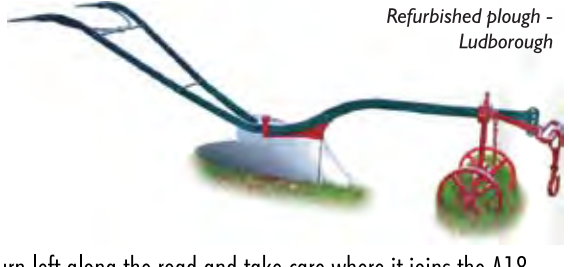
Refurbished plough - Ludborough

13 If you are walking The Way in two sections, this is where you either join or leave The Link to Ludborough.* To continue, keep ahead, soon following the line of telegraph poles to the road.