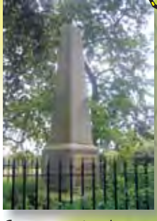
Commemorative plaque in Barnoldby le Beck