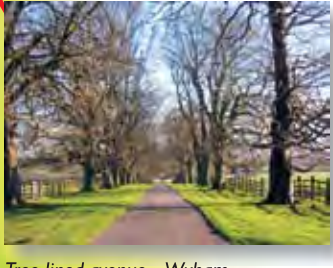
Tree lined avenue - Wyham