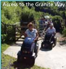
Access to the Granite Way

Most of the traffic-free section is wheelchair accessible although there are gates at the A30 underpass. There is no access for wheelchairs from Bearslake to Lake Viaduct.