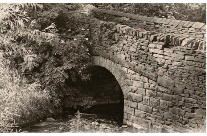
The former pack-horse bridge near Lower Putting Mill.