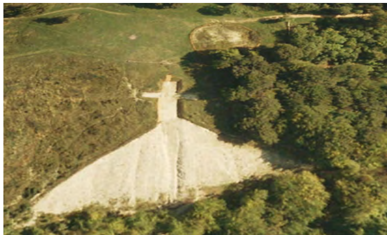
Fig. 4. The Whiteleaf Cross with the Neolithic barrow above.

The Ridgeway ancient track passes close to the barrow, and the Icknield Way runs along the foot of the steep slope. There is also a Cross Ridge dyke, dated to the Bronze Age. Other earthworks and ditches amongst the beech woods at the top of the hills are the remnants of first world war 'practice' trenches. The date of the cross itself is undetermined. Speculation that it represents a Christianised fertility symbol remains just that: there is no mention of the cross until 1700.