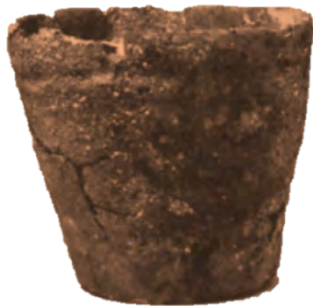
Fig.4. Bronze Age cremation urn.

Other finds included 570 worked flints (Fig. 3), and animal bones including 38 from red deer, 23 from pig, 12 from sheep, and 10 from ox. An inverted urn covering cremated human bones was found just under the turf in the southern lobe of the barrow. The urn stands 133 mm high, diameter 127 mm at the rim and 102 mm at the base (Fig. 4). It is of very coarse clay heavily mixed with angular grit. The rim is simple but just below is a shallow horizontal groove about 5 mm wide. The urn contained the cremated remains of a child aged 3–4 yrs.