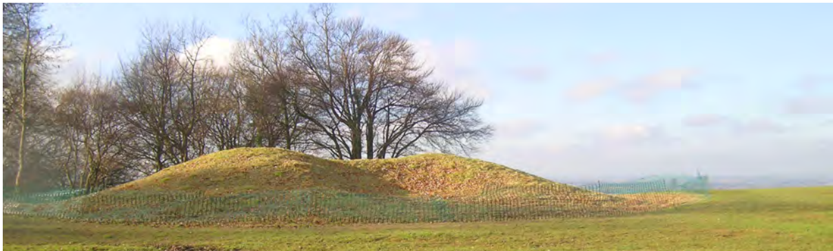
Fig. 1. Whiteleaf Hill oval barrow and view over the Vale of Aylesbury.

Access & ownership: The barrow is a Scheduled Monument. There is a public car park and level walk to the barrow above Whiteleaf Cross.